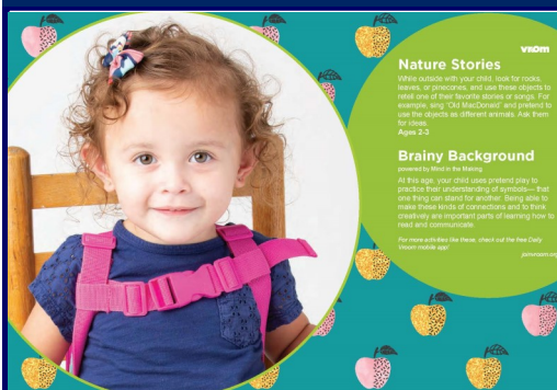
ChildOne Calendar September Photo